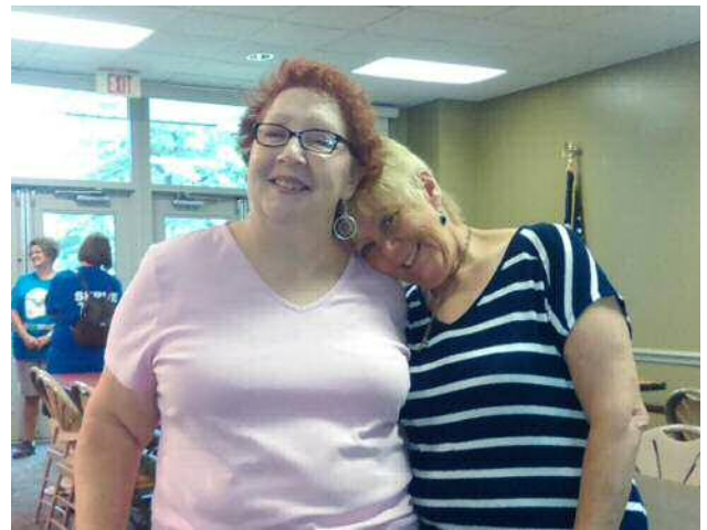
Some came a long distance to join us